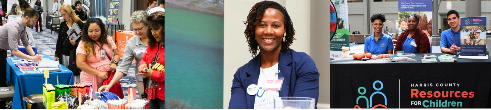
EXHIBIT AT THE CONFERENCE

$550 for TNOYS members | $875 for non-members