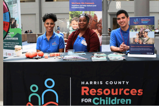
EXHIBIT AT THE CONFERENCE

$550 for TNOYS members | $875 for non-members